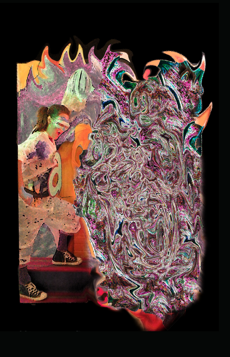
And kept painting...