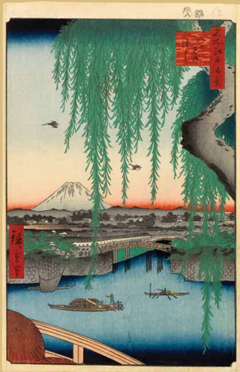
Yatsumi Bridge, No.45 from One Hundred Famous Views of Edo, Utagawa Hiroshige.