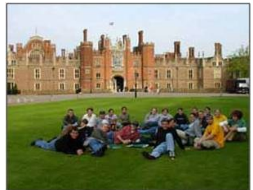
Maymester Study Abroad in Great Britain

However, as your local History Department "International Programs Liaison," it's my job to wave the flag a bit and to help my colleagues keep up to speed about study abroad options in their areas of geographic expertise. We all feel that time away from Purdue is an important part of your educational experience, and want to facilitate this in any way we can. Feel free, always, to swing by my office hours -- this semester running on Tuesday & Thursday afternoons from 1:30 - 3:00, or by appointment. Write to me at wgray@purdue.edu .