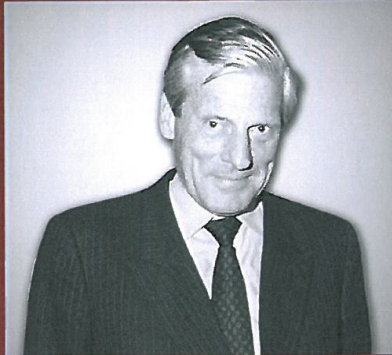
Dr. Walther Leisler Kiep

German business executive, politician and entrepreneur, Dr. Walther Leisler Kiep served on Volkswagen's advisory board for over 20 years; he was first elected to the Bundestag for the Christian Democratic Union in 1965, then was active in state politics in Lower Saxony and Hamburg. He served two decades as CDU party treasurer. In recent years Dr. Kiep has served as president of the European Business School. He now promotes exchanges among aspiring European, American, and Chinese leaders through two highly regarded organizations, the "Atlantic Bridge" and "Atlantic Forum."