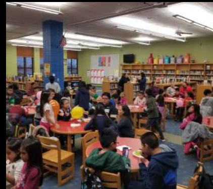
Aprendiendo a leer classroom

Aprendiendo a Leer is an after-school literacy program for Spanish-English bilingual children from kindergarten through 5th grade. The goal of the program is to help bilingual children maintain and develop their native language and culture and communicate better with their family members. The program runs every year in collaboration with the Tippecanoe School Corporation in Lafayette, Indiana. Dozens of children are participating in the program each semester, with Purdue students who are majoring or minoring in Spanish doing the teaching.