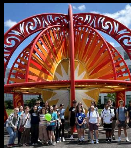
2025 STARTALK Campers