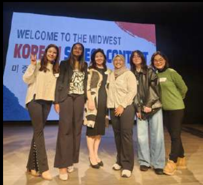
Representing the Korean Program at Purdue