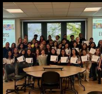
Ayuda y Aprende students with their certificates

Ayuda y Aprende is a mutually beneficial program in which Colombian undergraduate research interns and Purdue intermediate Spanish students meet weekly for two-hour sessions to practice conversation in both Spanish and English. This model of experiential learning allows language development to extend beyond the classroom in ways that direct instruction alone cannot achieve. For Purdue students, AyA offers a meaningful first application of their language studies. For the Colombian participants, it provides essential English practice that supports their immersion into campus life.