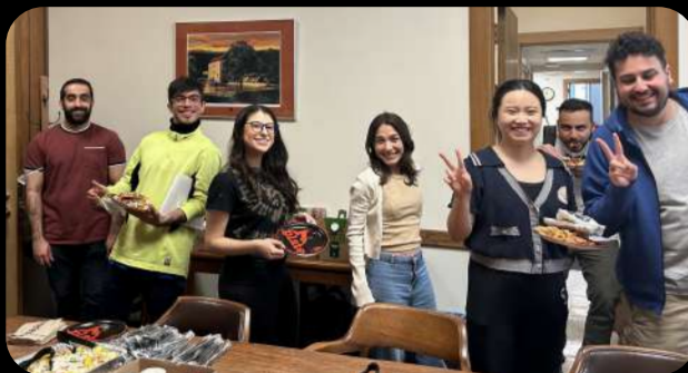
Pizza lunch celebrating SLC graduate students and TAs in May 2024. Thank you to our anonymous donor who sponsored it!