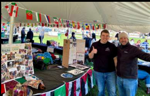
Purdue Spring Fest 2025

Students from different local high schools—such as Eastern, Northwestern, Tippecanoe Valley, Tri-Central, West Lafayette Jr/Sr High School—and some of their teachers attended our 5th annual SLC Open House for high schoolers on September 18 th , 2024. The event had a huge turnout of a few hundred students and teachers, and the SLC community planned creative, fun activities for the students. A big success!