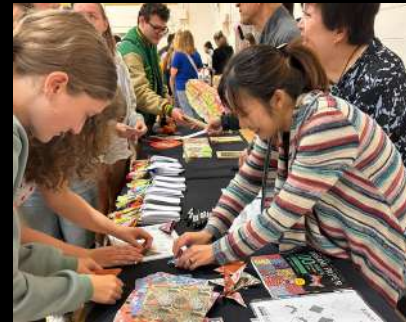
SLC Open House