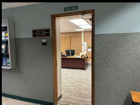
SC 146 Complex and Twyla's new office

Renovations are nearly complete as we welcome the Department of English to Stanley Coulter this summer!