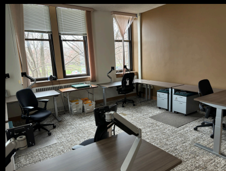
New office space in the prior computer lab SC180