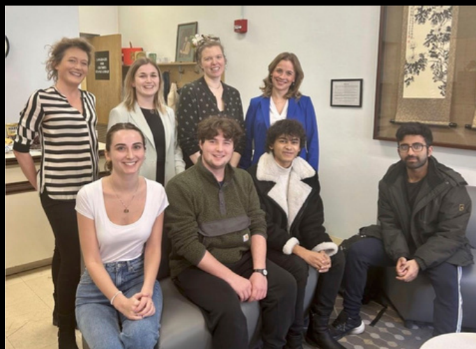
German Wine Princess and Queen met with students during Kaffeestunde.