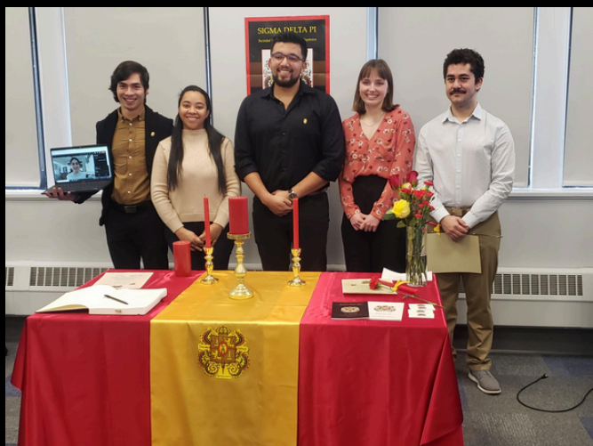
New Delta Sigma Chapter members inducted during December ceremony.