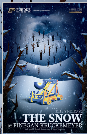
Poster design by Alexa Pinarski, VCD BFA '25

When an epic snowfall imprisons the residents of the tiny village of Kishka, young Theodore Sutton proposes the villagers build a catapult to fling him and six of the village's bravest and strongest out in search of a solution. The catapult hastily assembled, Theodore and the heroes are launched over the snow and into the grandest of adventures. Whimsical and humorous, dark and mysterious, heartfelt and sincere, this play weaves a fantastical Grimmsian tale for the entire family.