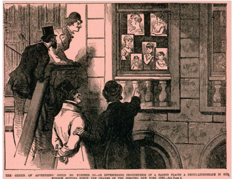
THE GENIUS OF ADVERTISING COULD NO FURTHER GO—AN ENTERPRISING PROPRIETRESS OF A BAZAR PLACES A PHOTO-LITHOGRAPH IN HER WINDOW SETTING FORTH THE CHARM OF THE INMATE; NEW YORK CITY.—See Page 2.

This course will illuminate broad themes in the historical regulation of sexual violence, consensual sex, and homosexuality. Students will understand and analyze how cultural, social, religious, and moral ideologies have influenced conceptions of deviant and normative sexuality in the United States.