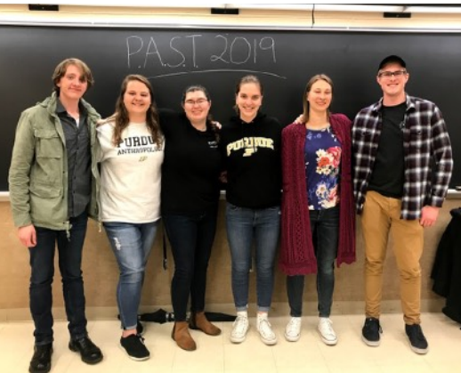
2019-2020 P.A.S.T. Executive Board