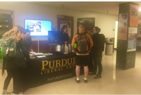
Faculty, AGSO and PAST members teamed together to celebrate Anthropology Day on February 20, 2020