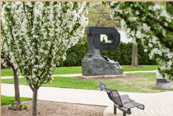
Spring campus scenes

Congratulations on your many accomplishments!