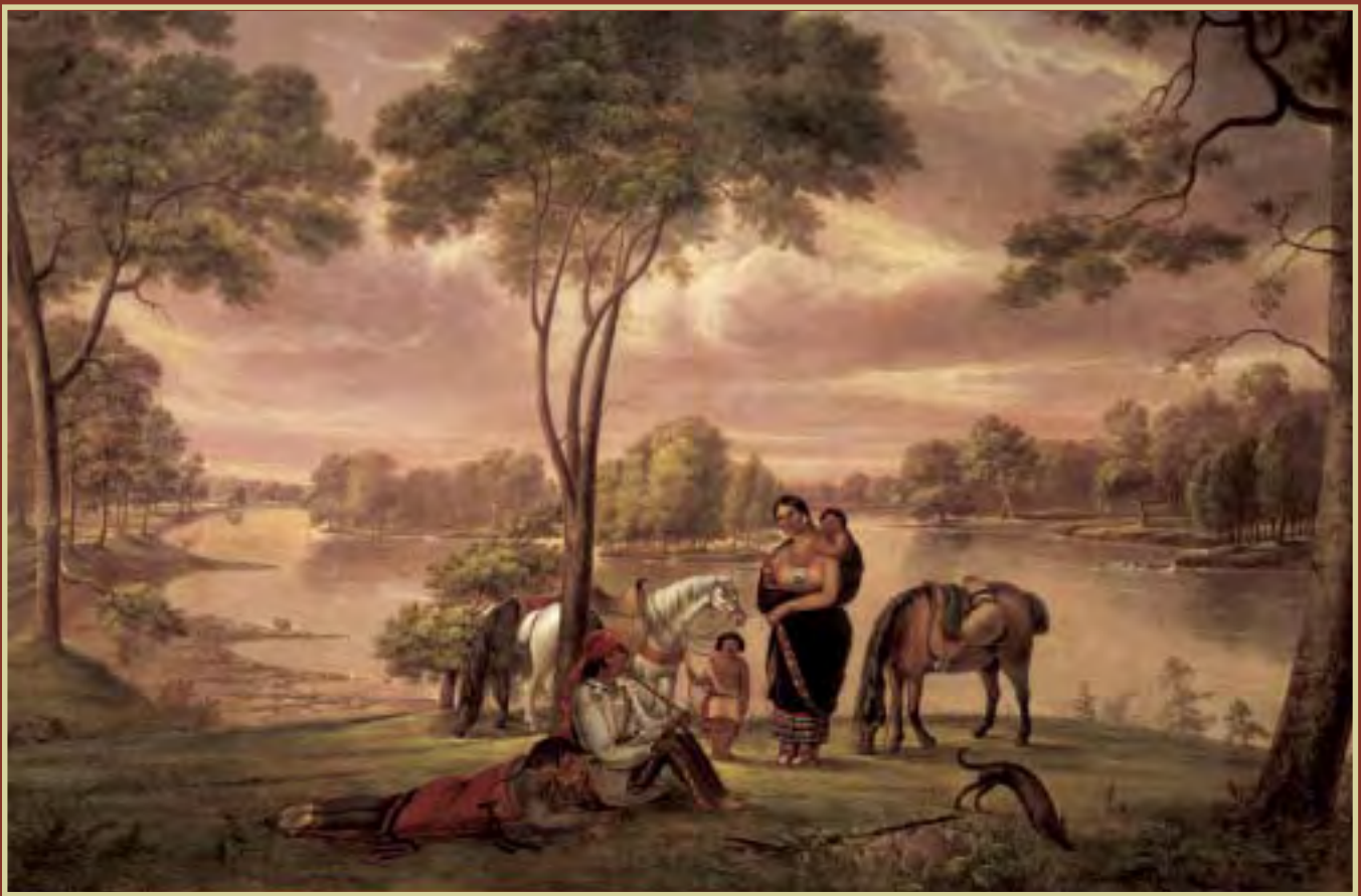
George Winter , Scene Along Wabash River , Oil on canvas, 38 x 54 inches.