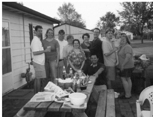
Graduate students and their loved ones celebrate the end of the academic year at the HGSA's spring picnic in May.

For the spring, classroom issues and the research of graduate students will take center stage. The Works-in-Progress Series will return with two different sessions, providing graduate students an opportunity to present their ongoing work and receive input and criticism from faculty and other graduate students. In addition, a workshop dealing with classroom violence as well as a brownbag on diversity in the classroom will complete the schedule for this spring.