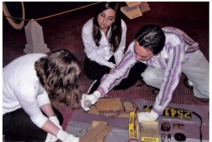
Curatorial staff members examine and record artifacts found in a hidden compartment under the driver's seat of a 1910s Auburn.

At the Auburn Cord Duesenberg Automobile Museum, I specifically requested to experience every aspect of work at a museum, and therefore had the opportunity to see and do a great variety of tasks from running the admissions desk, giving museum tours, and helping to preserve artifacts and archives. The main thrust of my position was to aid in curatorial staff work, which included doing archival research for an upcoming exhibit involving "Racers and Record-Setters" of automobile history. This exhibit, along with the rest of the museum, will be outfitted with touch-screen technology including images and text information about specific cars on display, and I compiled research for one such car as well as created a multi-dimensional timeline to be featured on the touch-screen displays. This timeline includes news at the world, national, and local levels. I made several trips to the local genealogy center to read newspaper