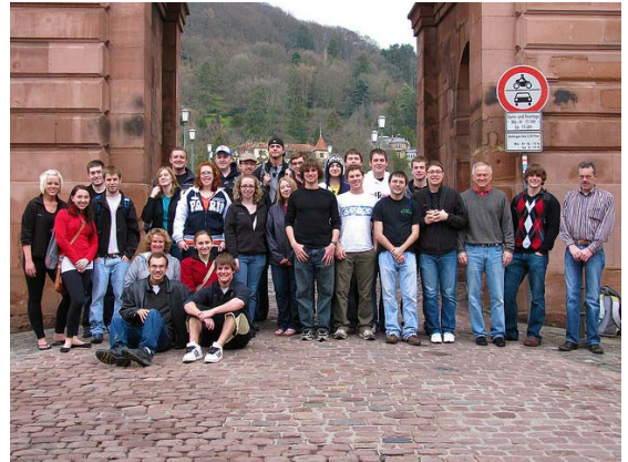
Spring Break Study Abroad in Germany