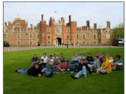
Maymester Study Abroad in Great Britain