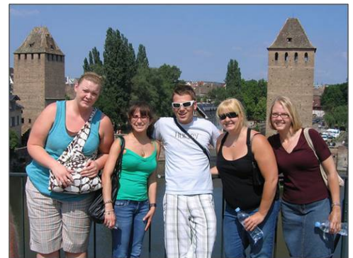
Maymester Study Abroad at Strasbourg