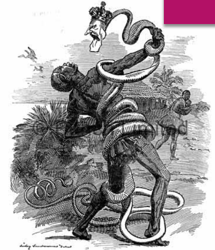
IN THE RUBBER COILS. Scene—The Congo "Free" State.