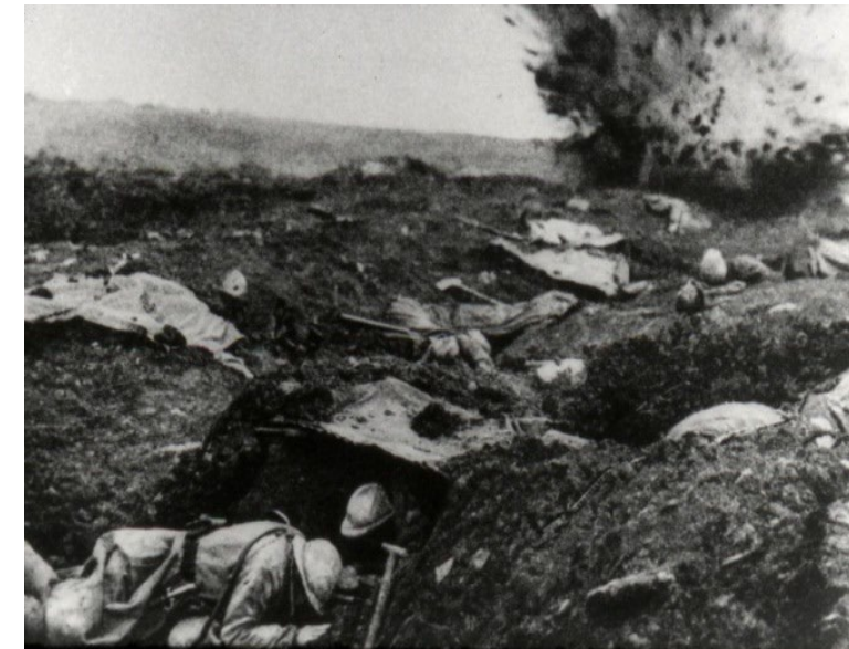
The battle of Verdun (1916)