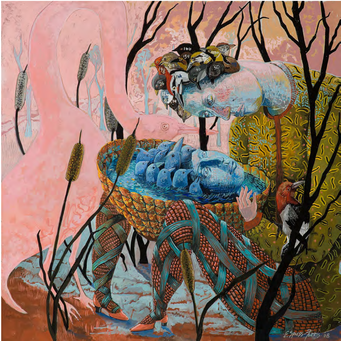
Eleanor Spiess-Ferris, "Pond Reflection," 2008, gouache, 22 x 22 in. From the exhibition Linked: Eleanor Spiess-Ferris & Michael Ferris , (March 5 through April 22, 2012).