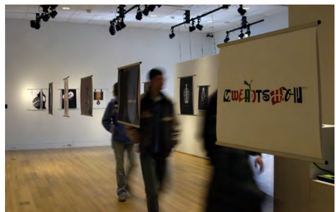
Student poster exhibition, 2008.