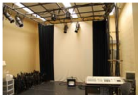
Dedicated Light Lab with its own consoles and instruments.

of-the-art facilities (just opened in 2006) skimp at nothing—