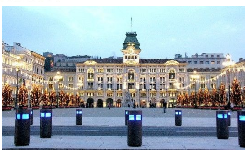
Piazza dell'Unità, positioned directly on the Mediterranean Sea, is one of the most imposing squares in Europe.

According to recent news articles, Italy is the most popular Study Abroad destination in the world. No matter where you go, you will see evidence of over 2000 years of human history expressed by the greatest assemblage of artists, writers, and composers the world has ever seen.