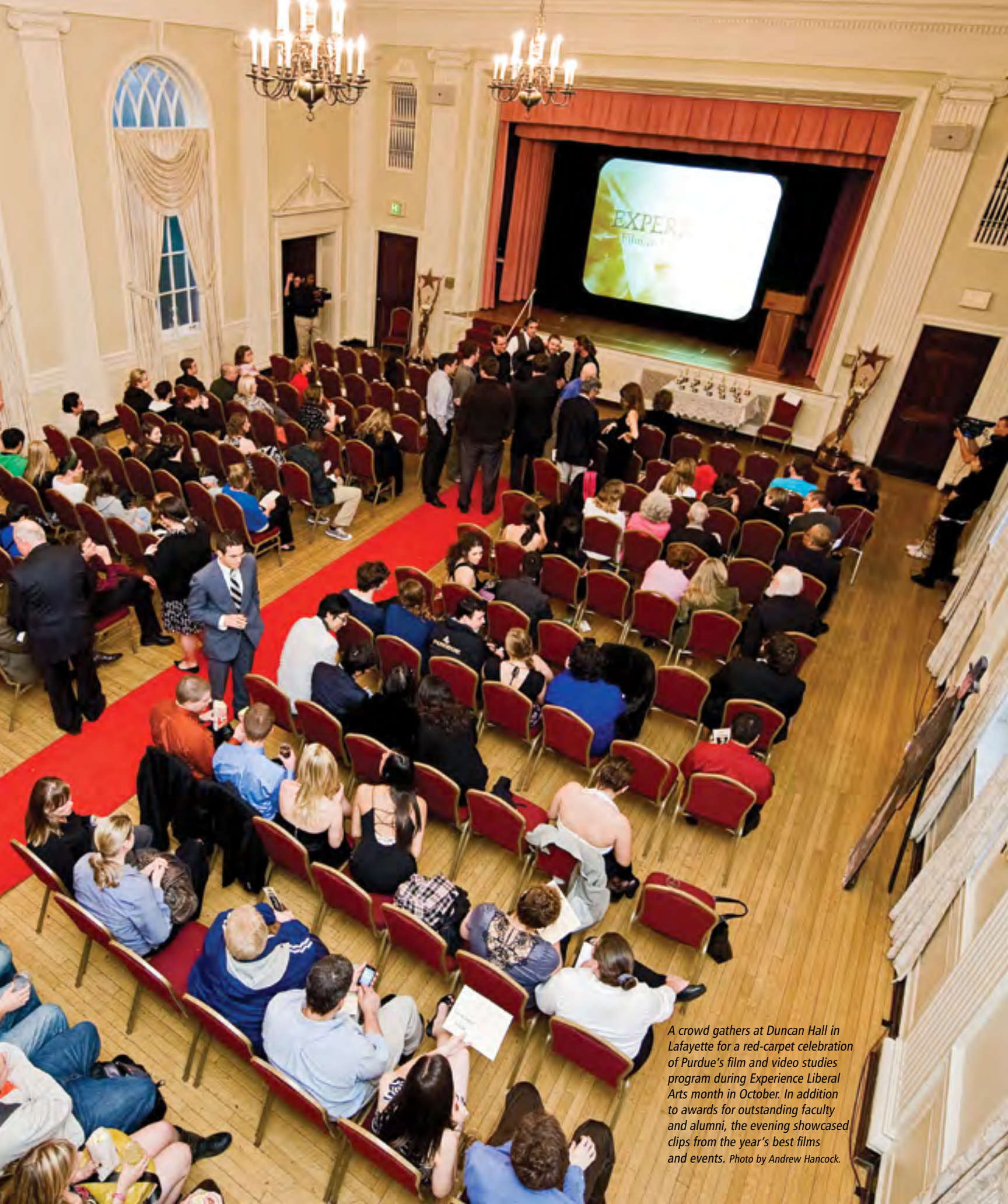
A crowd gathers at Duncan Hall in Lafayette for a red-carpet celebration of Purdue's film and video studies program during Experience Liberal Arts month in October. In addition to awards for outstanding faculty and alumni, the evening showcased clips from the year's best films and events.