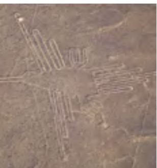
Nasca Lines in the Peruvian Desert