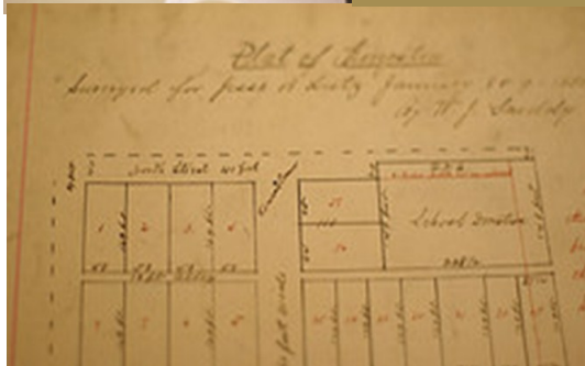
Below, Detail from the Plat Book