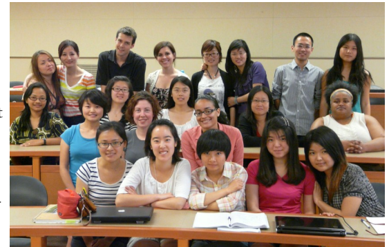
Purdue and ECNU student members of the 2011 "Transnational American Studies" course.

While this program requires effort and commitment from its participants, those involved recognize worth in building a transnational community of scholars. The yearly presence of this course serves as an invaluable part of an ongoing conversation and practice in Transnational American Studies, an advance toward future directions of the field, and a distinctive feature of Purdue and ECNU's American Studies graduate programs.