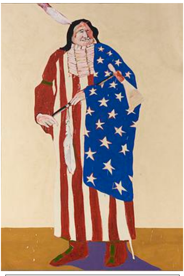
The American Indian, Fritz Scholder, oil on linen, 1970.