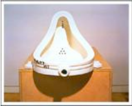
Fountain, Marcel Duchamp