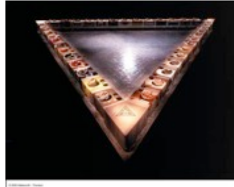
Judy Chicago, The Dinner Party, 1979