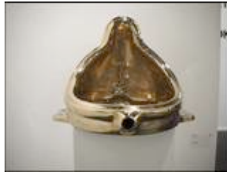
Fountain, Sherrie Levine