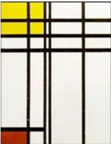
Piet Mondrian, Opposition of Lines, Red and Yellow