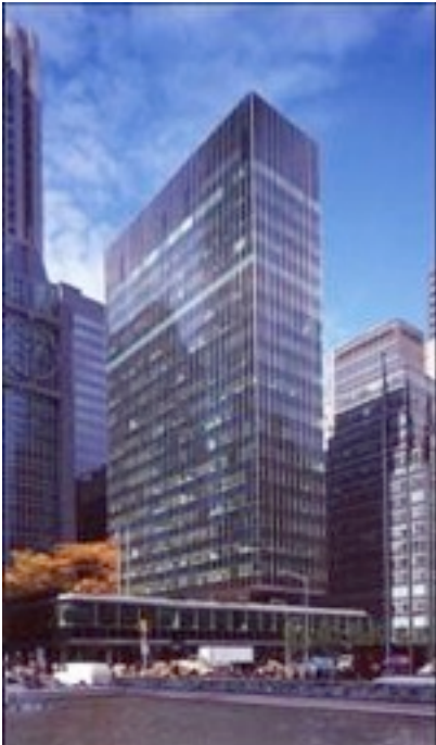
Skidmore, Owings, and Merrill, Lever House, 1951-1952, New York