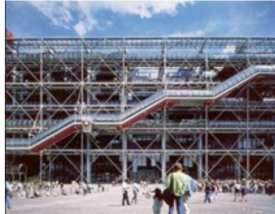
Richard Rogers and Renzo Piano, Georges Pompidou National Center of Art and Culture, 1977, Paris