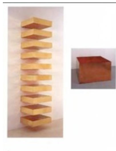
Donald Judd, Untitled, 1970