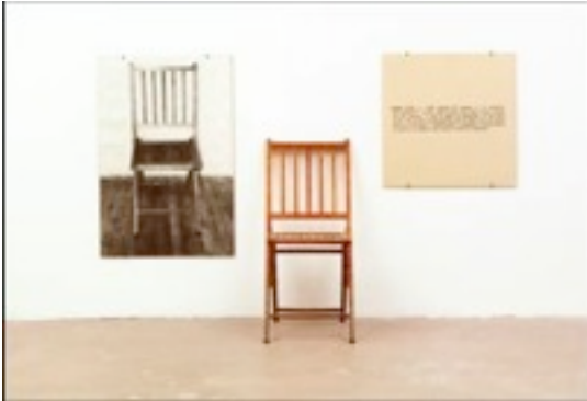
Joseph Kosuth, One and Three Chairs, 1965