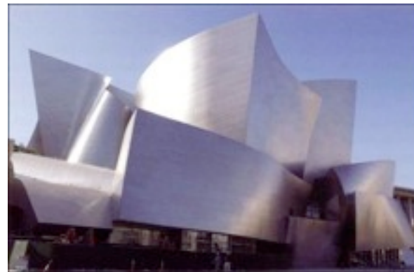
Frank Gehry, Walt Disney Concert Hall, 2004, Los Angeles