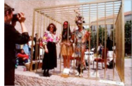
erformance Art : Guillermo Gómez-Peña and Coco Fusco, Two Undiscovered Amerindians Visit the West, 1992