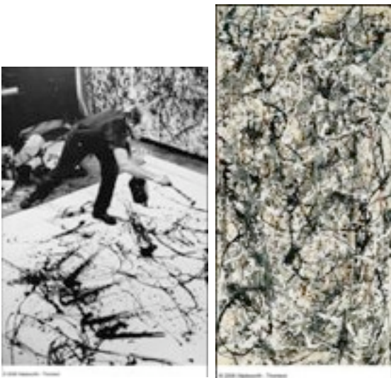
Jackson Pollock, Cathedral