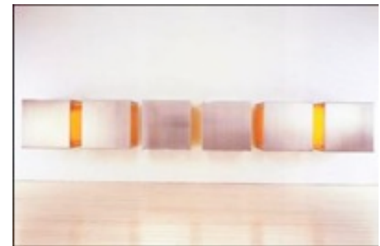
Donald Judd, Untitled, 1966