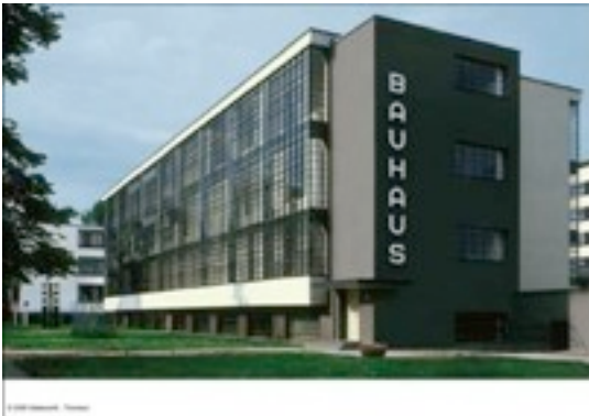
Walter Gropius, The Bauhaus, 1926, Dessau, Germany