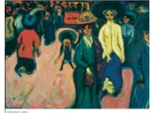
Ernst Ludwig Kirchner, Street, Dresden