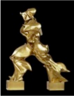
Umberto Boccioni, Unique Forms of Continuity in Space, 1913