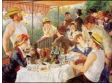
Pierre Auguste Renoir Luncheon of the Boating Party, 1880-1881