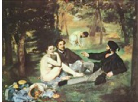
Edouard Manet Luncheon on the Grass, 1863