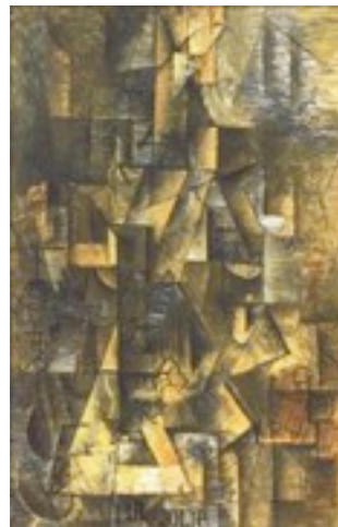
Pablo Picasso, Ma Jolie