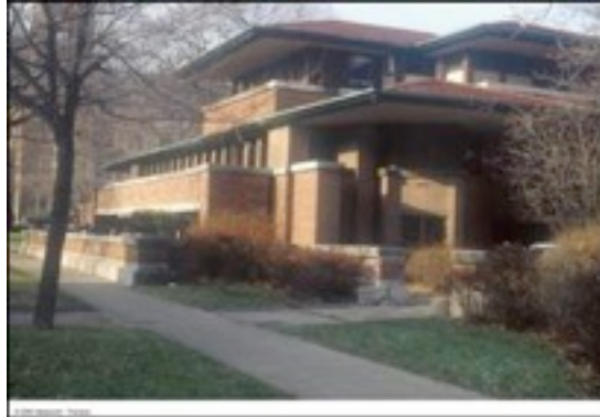
Frank Lloyd Wright, Robie House, Prairie Style