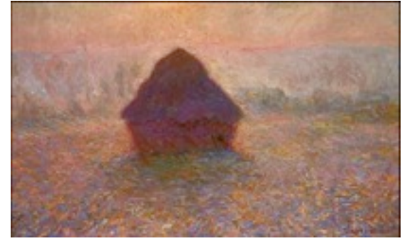
Claude Monet Grainstack, Sun in the Mist, 1891