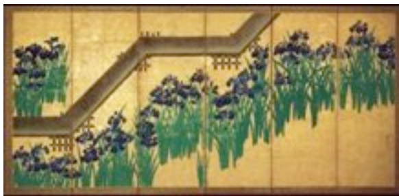
Ogata Korin, Eight-Planked Bridge, early 18th century