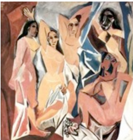
Pablo Picasso, Les Femmes d'Alger (O. J. G.), 1907