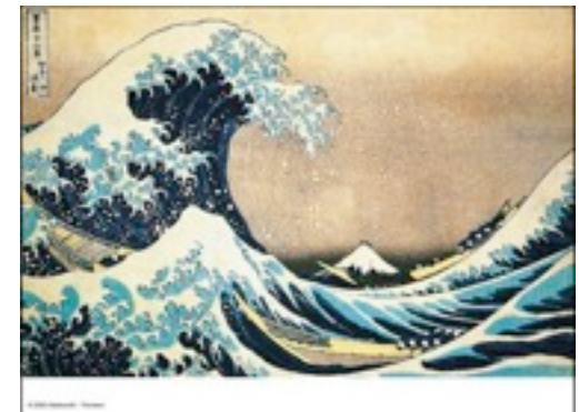
Katsushika Hokusai, The Great Wave Off Kanagawa, from The Thirty-Six Views of Fuji