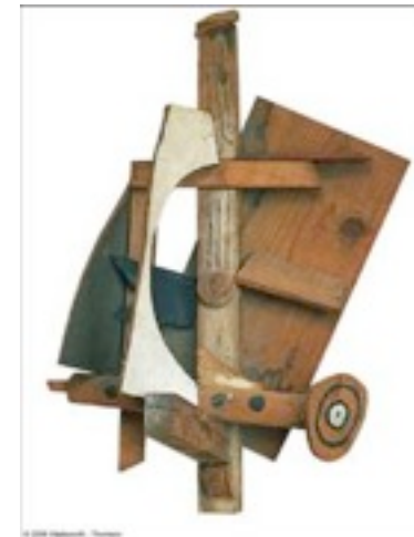
Pablo Picasso, Mandolin and Clarinet