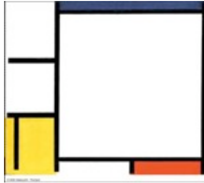
Piet Mondrian, Composition with Red, Yellow and Blue