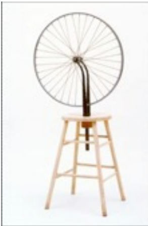
Marcel Duchamp, Bicycle Wheel, 1913