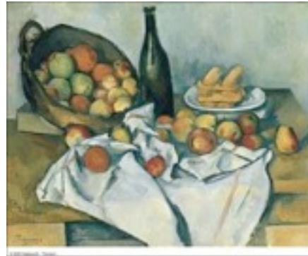
Paul Cezanne, The Basket of Apples