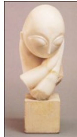
Constantin Brancusi, Mademoiselle Pogony