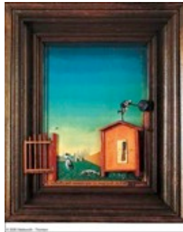
Max Ernst, Two Children Are Threatened by a Nightengale