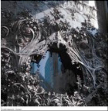
Louis Sullivan, Carson, Pirie, Scott Building