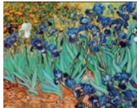
Vincent van Gogh, Iris, 1889