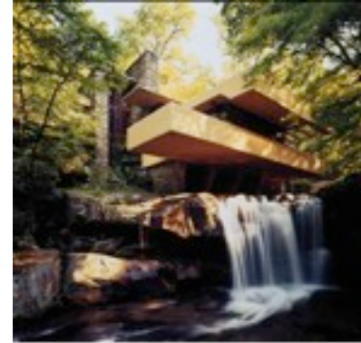
Frank Lloyd Wright, Falling Water, 1936-1939, Bear Run, Pennsylvania