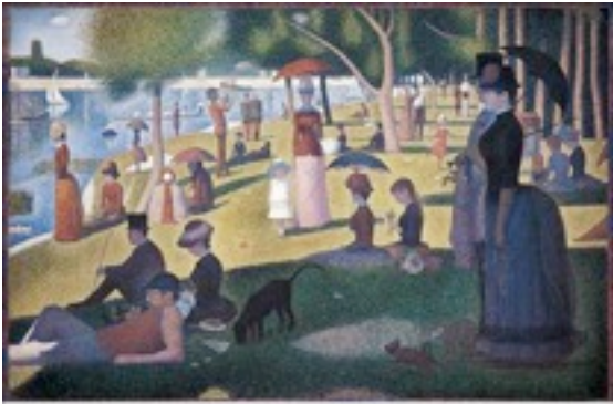
Georges Seurat, Sunday Afternoon on the Island of la Grande Jatte, 1884-1884