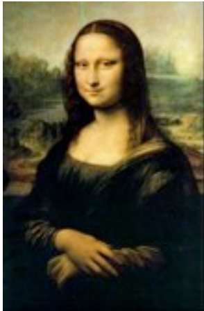
Leonardo da Vinci, Mona Lisa, 1503-1506