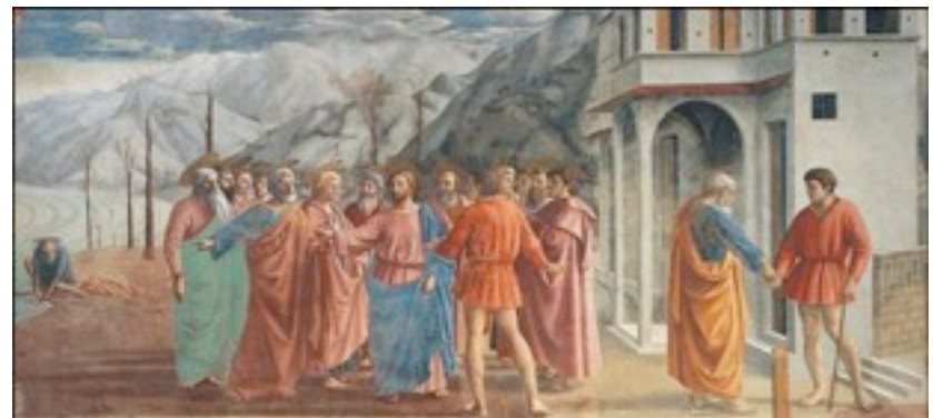
Masaccio, The Tribute Money, ca. 1427