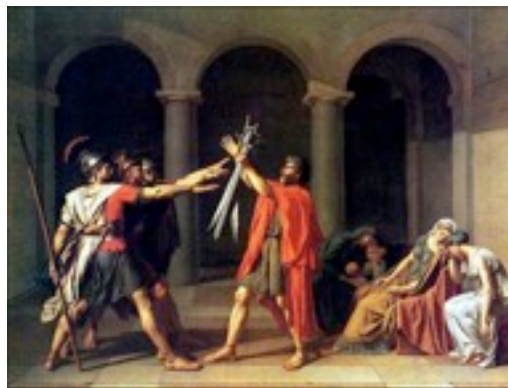
Jacques Louis David, Oath of the Horatii, 1784