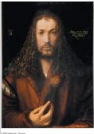
Albrecht Dürer, Self-Portrait, 1500