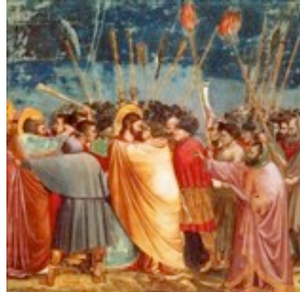
Giotto, The Betrayal of Judas, 1304-1306