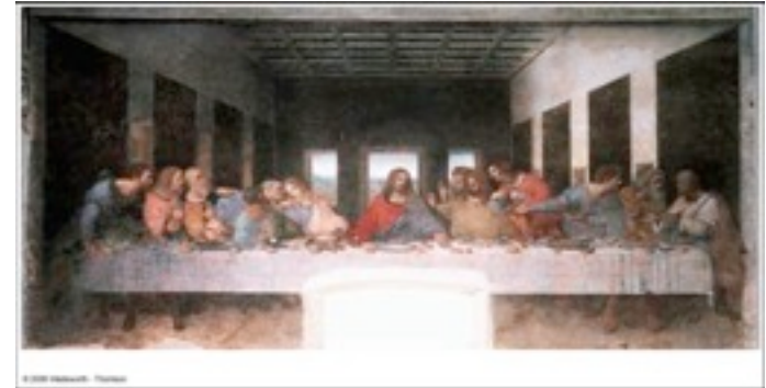
Leonardo da Vinci, The Last Supper, 1495-1498