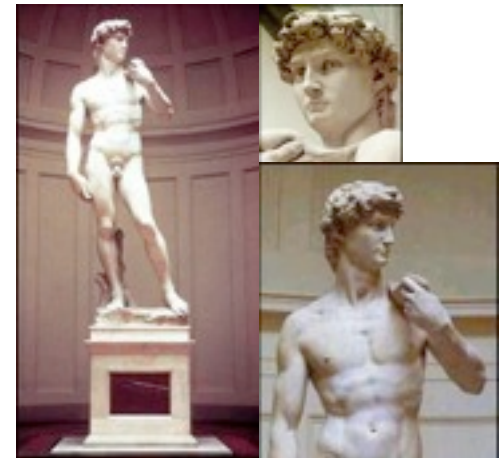
Michelangelo, David, 1501-04