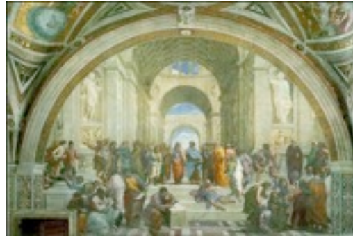
Raphael, School of Athens, 1510-11