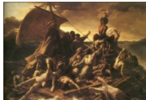
Theodore Gericault, Raft of the Medusa, 1818-1819