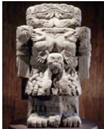
Coatlicue (Lady of the Skirt of Serpents), 15th century