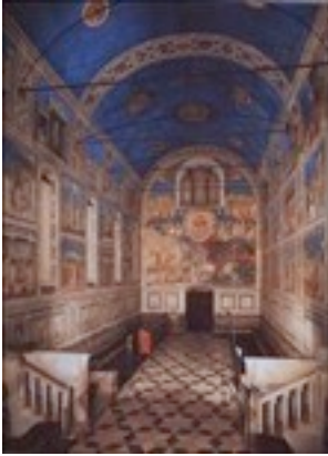
Giotto, Arena Chapel, Padua, Italy