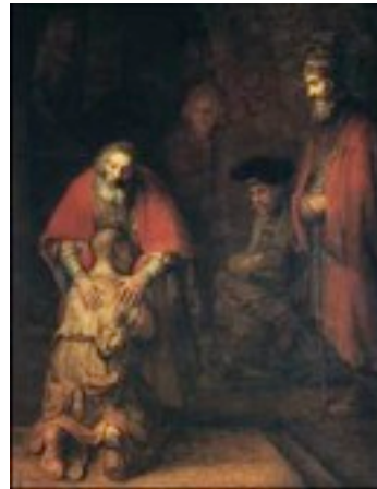
Rembrandt van Rijn, The Return of the Prodigal Son, ca. 1665