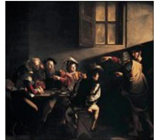
Caravaggio, The Calling of St. Matthew, 1599-1600