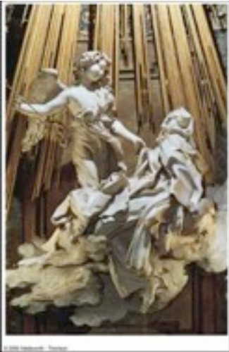
Gianlorenzo Bernini, The Ecstasy of St. Theresa, 1645-1650 Cornaro Chapel, Rome