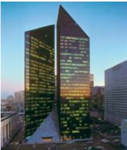
Philip Johnson & John Burgee, Pennzoil Plaza, 1970-1976