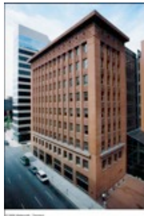
Dankmar Adler & Louis Sullivan, Wainwright Building, 1890–1891, St. Louis