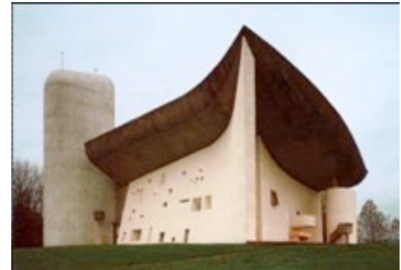
Le Corbusier, Notre Dame-du-Haut, France