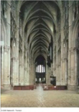
Chartres Cathedral, [French] interior looking east, begun 1194