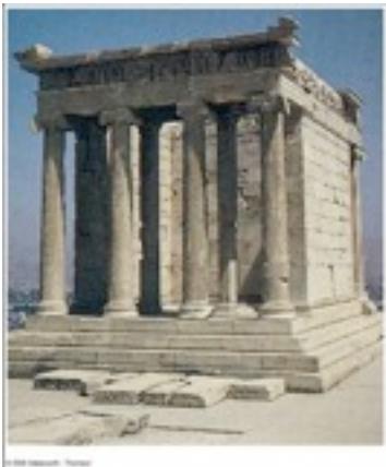
Temple of Athena Nike, 427–424 BCE, [Greek]