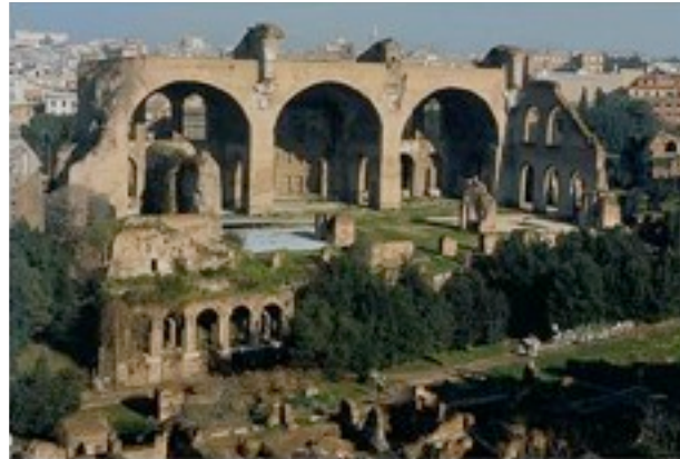
Roman Basilica of Constantine, begun by Maxentius in 307-312, completed by Constantine after 312. Rome