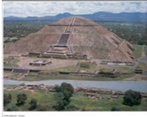
Pyramid of the Sun, Teotihuacán, Mexico ca. 100 BCE–500 CE. Pyramids of the Ciudadela in foreground