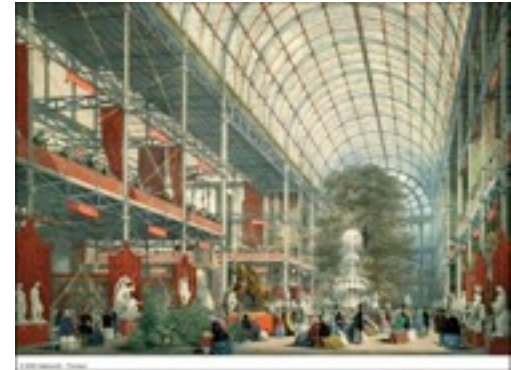
Joseph Paxton, Crystal Palace, 1851