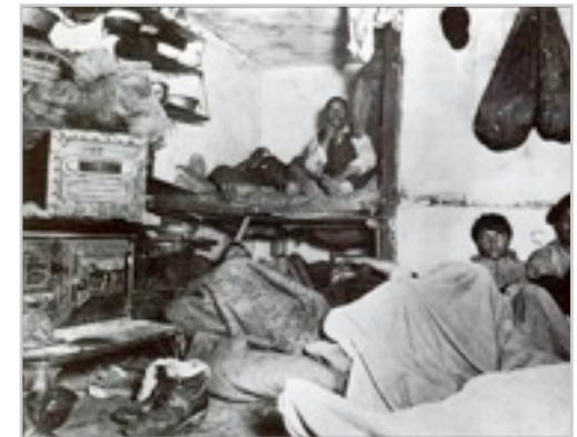
Jacob A. Riis