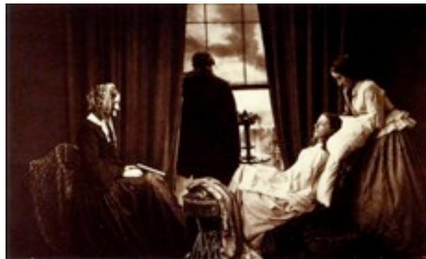
Henry Peach Robinson