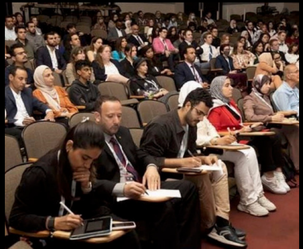
PURDUE ARABIC DEBATE TEAM AT STANFORD