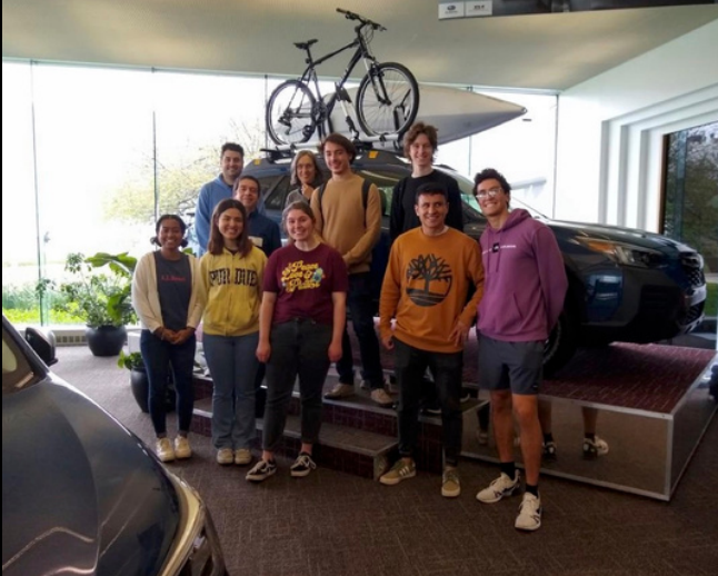
PURDUE STUDENTS AT THE SUBARU PLANT IN LAFAYETTE