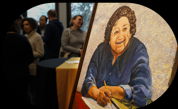
THE PORTRAIT OF HELEN BASS WILLIAMS DISPLAYED AT THE RECEPTION AFTER THE UNVEILING