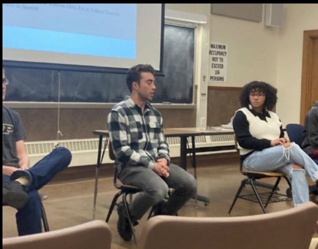
PURDUE STUDENTS TELLING OTHERS ABOUT THE BENEFITS OF DEGREE+