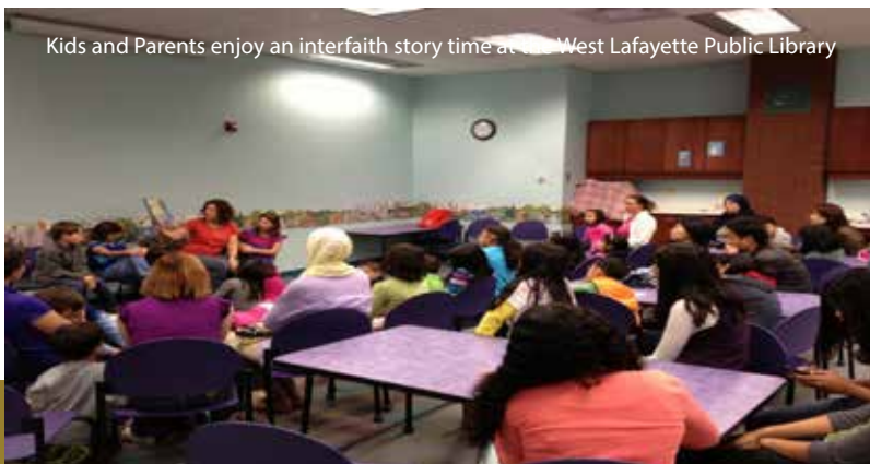
Kids and Parents enjoy an interfaith story time at the West Lafayette Public Library

For more information or to sign up to receive discussion questions, see: http://www.wlaf.lib.in.us/index.php/muslim-journeys .